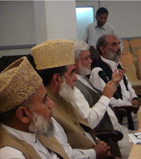
Religious leaders in Pakistan who worked with ESD to disseminate local fatwas in support of reproductive health and family planning.

The Extending Service Delivery (ESD) Project, funded by USAID's Bureau for Global Health, is designed to address an unmet need for family planning (FP) and to increase the use of reproductive health and family planning (RH/FP) services at the community level, especially among underserved populations, to improve health and socioeconomic development. To accomplish its mission, ESD has strengthened global learning and application of best practices; increased access to community-level RH/FP services; and improved capacity for supporting and sustaining RH/FP services. ESD has worked closely with USAID missions to devise tailored strategies that meet the RH/FP service delivery needs of specific countries. A five-year Leader with Associate Cooperative Agreement, ESD is managed by Pathfinder International in partnership with IntraHealth International, Management Sciences for Health, and Meridian Group International, Inc. Additional technical assistance is provided by Adventist Development and Relief Agency International, the Georgetown University Institute for Reproductive Health, and Save the Children.